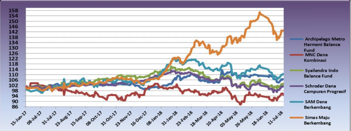
Performance of Archipelago Metro Harmoni Balance Fund (Since Inception)