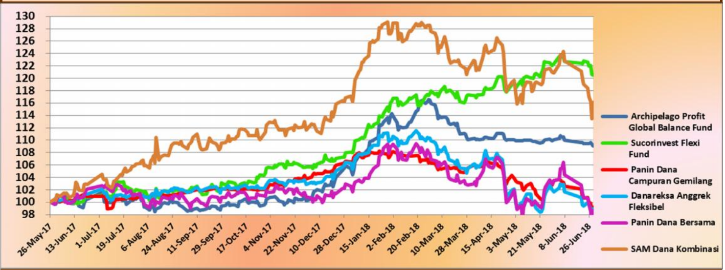
Performance of Archipelago Profit Global Balance Fund (Since Inception)