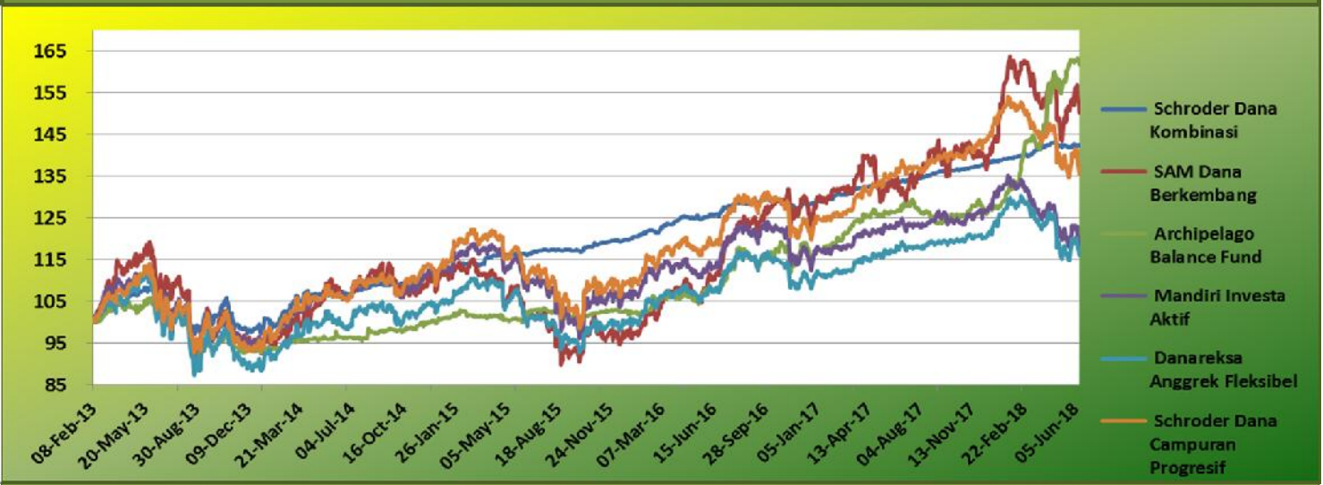
Performance of Archipelago Balance Fund (Since Inception)