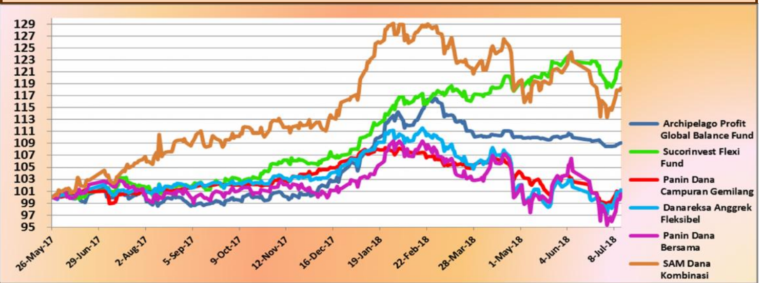
Performance of Archipelago Profit Global Balance Fund (Since Inception)