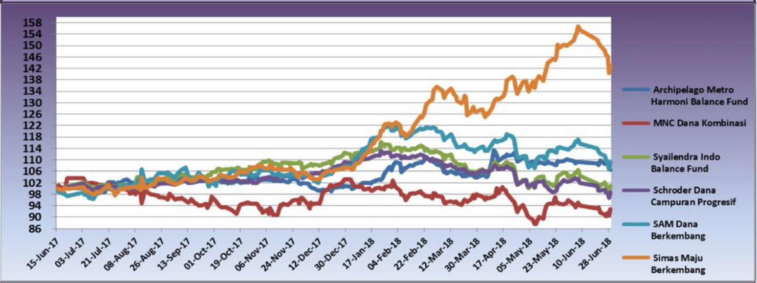
Performance of Archipelago Metro Harmoni Balance Fund (Since Inception)